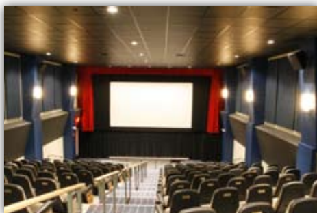
Lincoln Financial Cinema.

Ticket revenues cover only 60% of the costs of operating and maintaining Red River Theatres. Your tax-deductible contribution ensures Red River Theatres' success and supports independent cinema in the Capitol region.